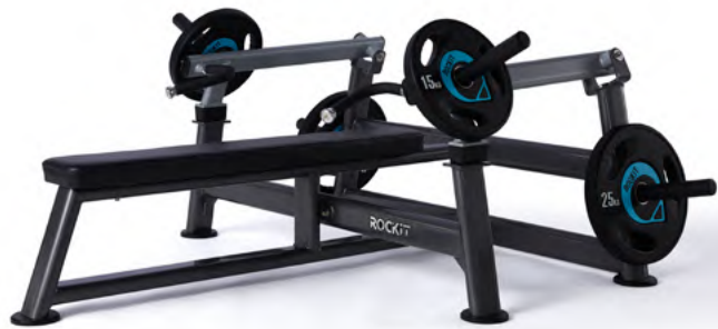
Plate-Loaded Horizontal Press