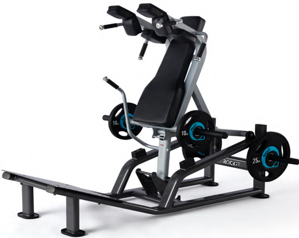
Plate-Loaded Hack Squat