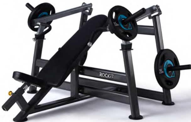
Plate-Loaded Incline Press