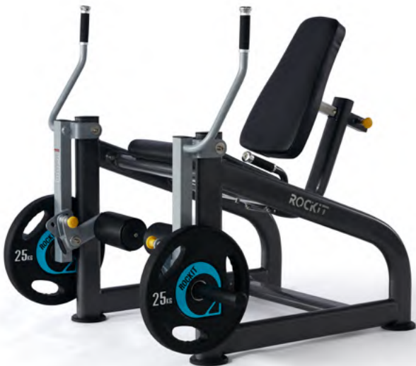
Plate-Loaded Leg Extension