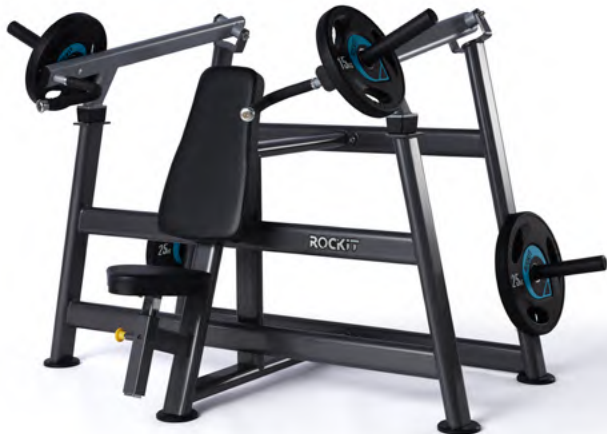
Plate-Loaded Shoulder Press

* Image for display only; rack excludes weights.