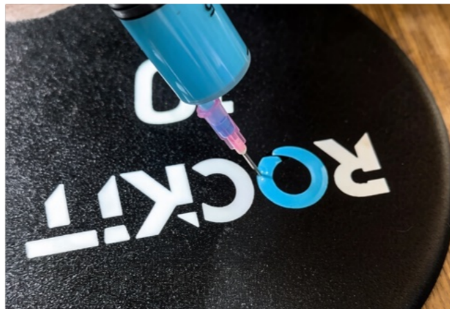
04_Polyurethane (PU) Liquid Filling