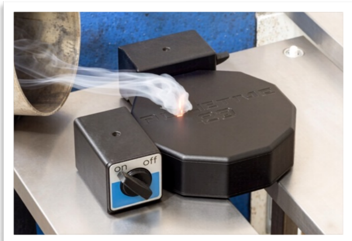
03_Laser Engraving / Marking