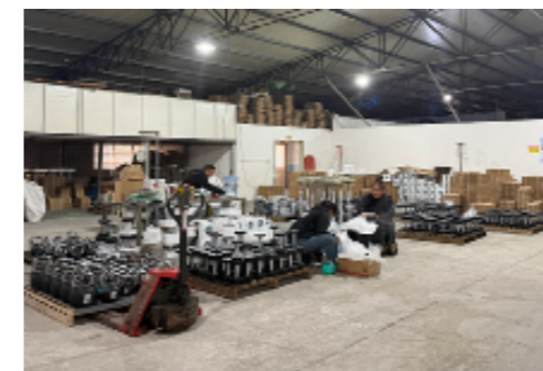
05_Final Assembling / Finishing