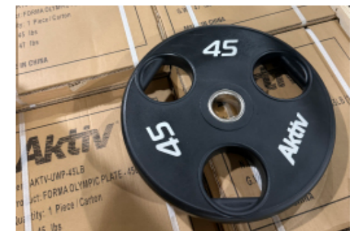
06_Packing, ready for transportation