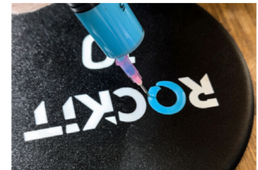
04_Polyurethane (PU) Liquid Filling